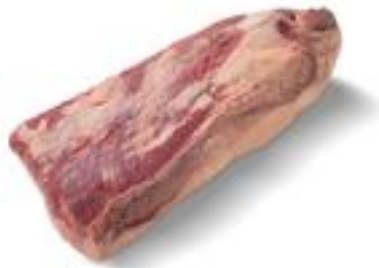
Image of product is not meant to represent the actual product trim specification

The Beef Brisket is a trimmed brisket made from a primal brisket after removal of the foreshank with lean exposed along the entire length of the tail (cut end) to expose an average thickness of 1/2" lean thickness along length of the tail. All bones, cartilage, shank and clod meat is removed. All cuts are trimmed smooth. The deckle fat is trimmed even with belly lean and flake fat allowed on the belly. The head or point should be rounded off with some arm meat allowed. Surface fat trimmed to an average fat thickness of 3/4" on the outside skin surface, including the breast curve and beveled to an average of 1/2" on the edges. The web muscle is trimmed. Must be a minimum 7" wide measured mid-point between point and tail, just below the deckle fat on the belly side.