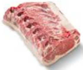
Image of product is not meant to represent the actual product trim specification

The Beef Loin Bnls Strip 1X1 is produced after tenderloin, bottom and top butt have been removed. The tail is removed by measuring approximately 1" from the extreme outer edge of the eye muscle at the rib end, and 1" from the extreme outer edge of the butt end of the loin towards the flank side. The feather bones, button bones and flat bones are removed. The 13th rib is removed along with any loose hanging membrane. Overall fat cover is trimmed to an average of 1" thickness. Fat in the saddle area will be bridged from lean to lean when measuring fat cover. The fat edges at both muscle ends of the strip loin are beveled to an average of 1/2". Inside fat on tail of strip is smoothed to approximately 1/2".