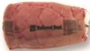
Image of product is not meant to represent the actual product trim specification

Beef Kidneys are removed from each carcass half by using a hand knife ensuring minimal fat is removed along with the Kidney Knob during harvesting.