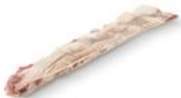
Image of product is not meant to represent the actual product trim specification

The Outside Skirt is the thickest portion of the diaphragm, which is located at an angle between the 12th and 6th ribs on the underside of the short plate. Skirt is removed from the short plate in one piece. The outer skin or membrane remains on the outside skirt, but is trimmed along the edges to show lean on approximately 75% on the outside and approximately 50% lean on side attached to inside skirt. Bottom end is cut to expose lean.