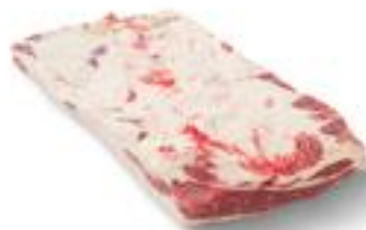
Plate is trimmed on the underside (bone side) to remove bone chips, cartilage, and loose tag ends. The plate should be approximately 9" in width and 10" to 19" in length, and 3/4" in thickness, exposing approximately 50% lean. Surface fat is trimmed to approximately 3/4" thick with ink removed. Belly is trimmed to remove bone chips, cartilage, and tunic tissue, dehydration/off color fat and tag ends.

Image of product is not meant to represent the actual product trim specification