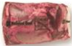
Image of product is not meant to represent the actual product trim specification

Method of Production: Beef Cheek Meat consists of the main cheek muscle, lying external to the upper and lower jaw bone, the muscle removed interior and exterior of the mandibles, extending from the muzzle back to, but excluding, the salivary glands, lymph nodes and fat.