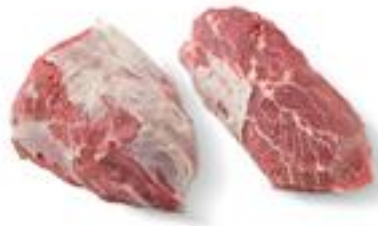
Image of product is not meant to represent the actual product trim specification

The Beef Chuck 2 PC. Clod Heart is derived from a commodity Beef Chuck Shoulder Clod. The Clod Heart is obtained by removing all outside muscles leaving only the Triceps Brachii (the main clod/heart muscle). Surface fat is trimmed to approximately 1/8". All adjacent muscles and tag ends are removed. Cuts are trimmed smooth. The top blade is separated from the clod by following the seam between the nose of the top blade and shoulder muscles. The finished top blade should be rectangular in shape; surface fat is trimmed to the silver skin with flake fat, approximately 1/8", allowed, tissue on the belly side, including cartilage is removed to expose lean. Tail and head of the top blade are blocked. All adjacent muscles and tag ends are removed. Cuts are trimmed smooth.