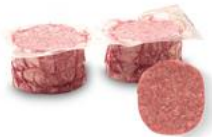
Image of product is not meant to represent the actual product trim specification

National Beef's FINE GROUND BRISKET / CHUCK PATTIES use trimmings that are from the Brisket and Chuck. The raw material is ground and blended to the appropriate fat content, then run through a finished grinder with a metal detection step.