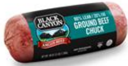
Image of product is not meant to represent the actual product trim specification

National Beef's GROUND CHUCK uses trimmings that are from the Chuck, including Chuck Cap, Clods, Pectoral, Chuck Trim, and Chuck Roll. Shank will be added. The raw material is ground and blended to the appropriate fat content, then run through a finished grinder with a metal detection step.