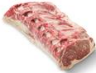
Image of product is not meant to represent the actual product trim specification

The Beef Loin Bnls Strip 0X1 is produced after tenderloin, bottom and top butt have been removed. The tail is removed by measuring approximately 1" from the extreme outer edge of the eye muscle at the rib end, and 0" from the extreme outer edge of the butt end of the loin towards the flank side. The feather bones, button bones and flat bones are removed. The 13th rib is removed along with any loose hanging membrane. Overall fat cover is trimmed to a max of 1/4" thickness. Fat in the saddle area will be bridged from lean to lean when measuring fat cover. The fat edges at both muscle ends of the strip loin are beveled to a maximum of 1/4". Inside fat on tail of strip is smoothed to max 1/4".