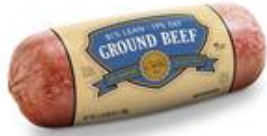
Image of product is not meant to represent the actual product trim specification

National Beef's 81/19 GROUND BEEF, uses trimmings that are from commodity trim, including Shank, 75/25 Deluxe Trimmings, 65/35 Deluxe Trimmings, Finger Trim. The raw material is ground and blended to the appropriate fat content then run through a finished grinder with a metal detection step.