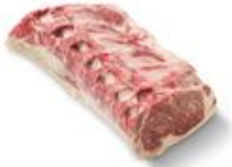
Image of product is not meant to represent the actual product trim specification

The Beef Loin Bnls Strip 0X1 is produced after tenderloin, bottom and top butt have been removed. The tail is removed by measuring approximately 1" from the extreme outer edge of the eye muscle at the rib end, and 0" from the extreme outer edge of the butt end of the loin towards the flank side. The feather bones, button bones and flat bones are removed. The 13th rib is removed along with any loose hanging membrane. Overall fat cover is trimmed to a max of 1/4" thickness. Fat in the saddle area will be bridged from lean to lean when measuring fat cover. The fat edges at both muscle ends of the strip loin are beveled to a maximum of 1/4". Inside fat on tail of strip is smoothed to max 1/4".