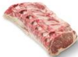
Image of product is not meant to represent the actual product trim specification

The Beef Loin BNLS Strip 0X1 is produced after tenderloin, bottom and top butt have been removed. The tail is removed by measuring approximately 1" from the extreme outer edge of the eye muscle at the rib end, and 0" from the extreme outer edge of the butt end of the loin towards the flank side. The feather bones, button bones and flat bones are removed. The 13th rib is removed along with any loose hanging membrane. Overall fat cover is trimmed to a max of 1/4" thickness. Fat in the saddle area will be bridged from lean to lean when measuring fat cover. The fat edges at both muscle ends of the strip loin are beveled to a maximum of 1/4". Inside fat on tail of strip is smoothed to max 1/4".