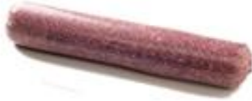
Image of product is not meant to represent the actual product trim specification

National Beef's 73/27 GROUND BEEF, uses trimmings that are from commodity trim, including Shank, 75/25 Deluxe Trimmings, 65/35 Deluxe Trimmings, Finger Trim. Products that are grade and/or breed specific will only contain trimmings from carcasses identified as that specific grade and/or breed and labeled as such. The raw material is ground and blended to the appropriate fat content, then run through a finished grinder with a metal detection step.