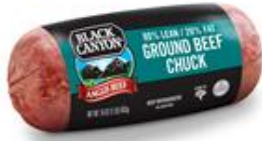
Image of product is not meant to represent the actual product trim specification

National Beef's GROUND CHUCK uses trimmings that are from the Chuck, including Chuck Cap, Clods, Pectoral, Chuck Trim, and Chuck Roll. Shank will be added. The raw material is ground and blended to the appropriate fat content, then run through a finished grinder with a metal detection step.