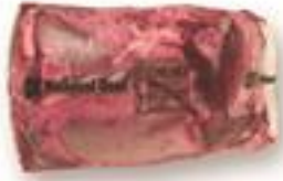
Image of product is not meant to represent the actual product trim specification

Method of Production: Beef Cheek Meat consists of the main cheek muscle, lying external to the upper and lower jaw bone, the muscle removed interior and exterior of the mandibles, extending from the muzzle back to, but excluding, the salivary glands, lymph nodes and fat.